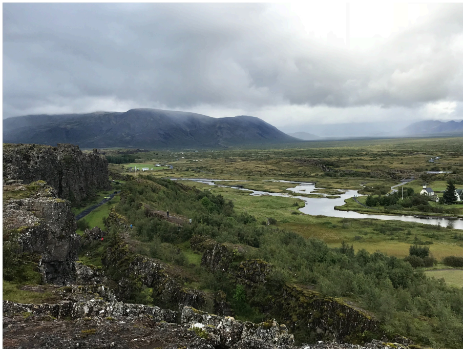
Pingvellir in 2018